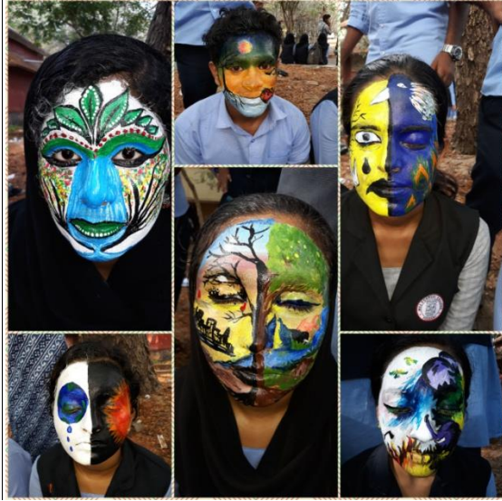
Fig: Face painting Competition winners