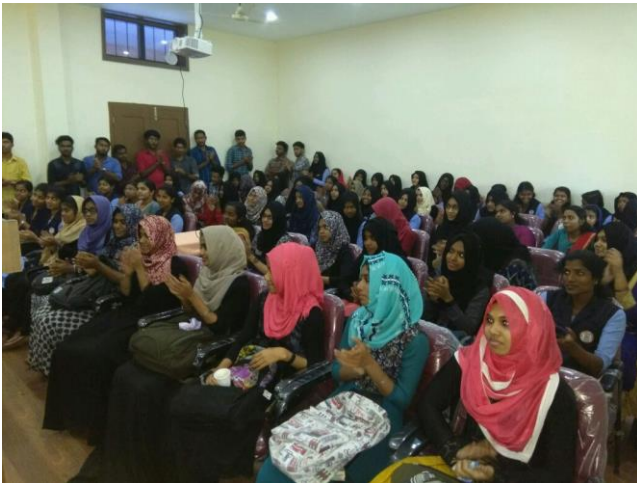
Fig: Students attending the seminar at conference hall