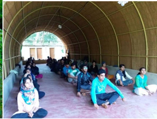
Fig: Yoga at camp centre