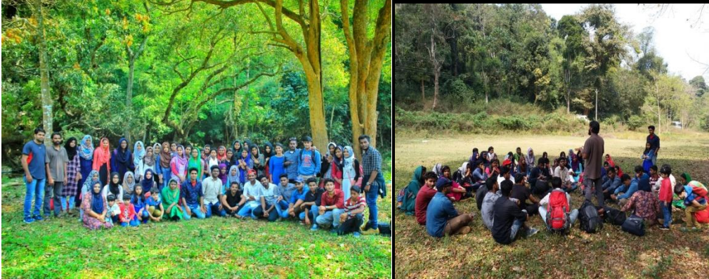
Fig Camp centre at Kayyeni