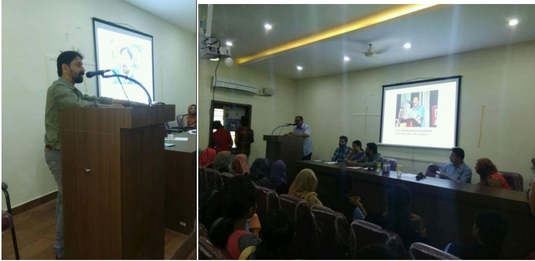
Fig: Inauguration of Bhoomithrasena club by Sri. Hamid Ali