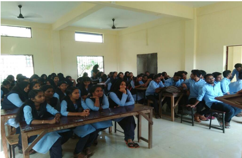
Fig: Meeting of club members at Room No. 414