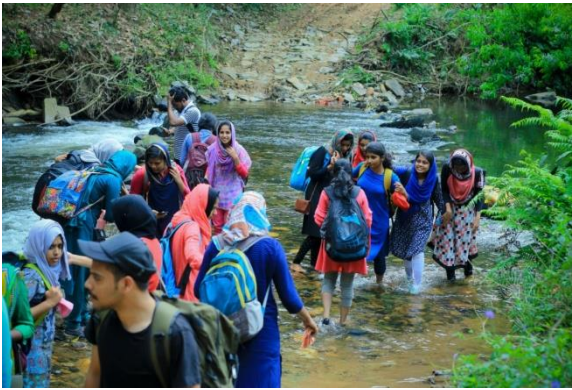
Fig: In Siruvani river