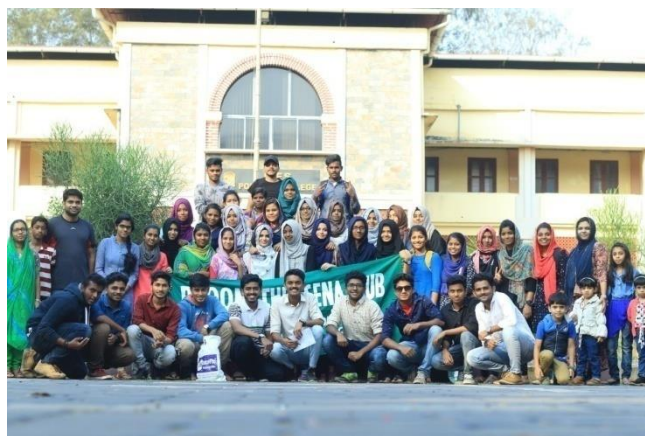
Fig. Start of the journey from college