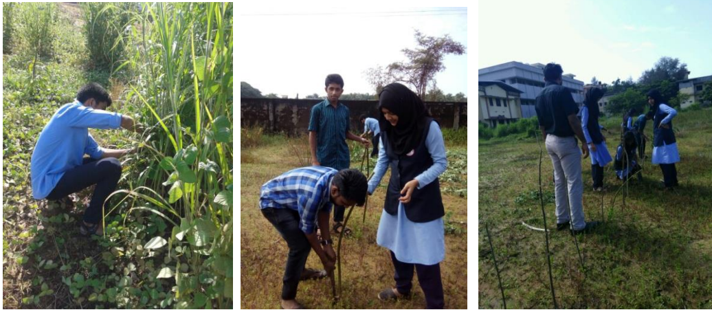
Fig: Bhoomithrasena Club members engaged in green campus activities