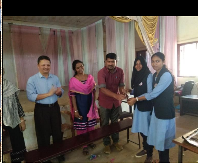
Fig: Principal distributing prize to the winners